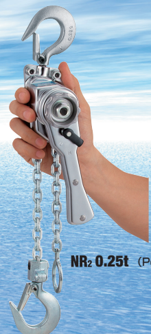
NR2 0.25t (Petit)

The winch hook is equipped with an anti-slip knob. Even if the hook is stretched slightly, the wire rope catches on the anti-slip knob to prevent it from slipping off the hook, ensuring safe operation.